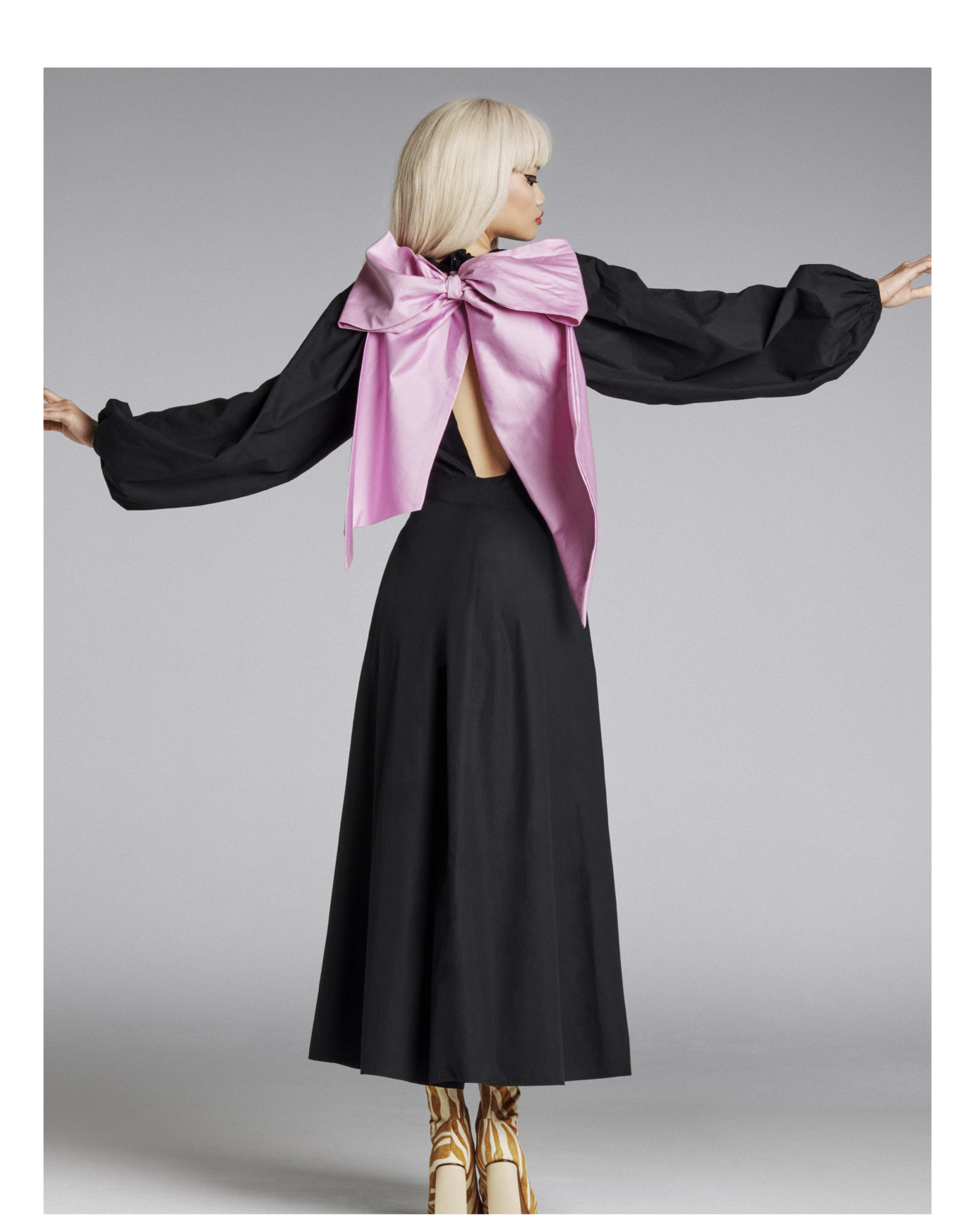
Look\ 3 - Black Cotton Poplin Dress with a Detachable Back Bow AW22